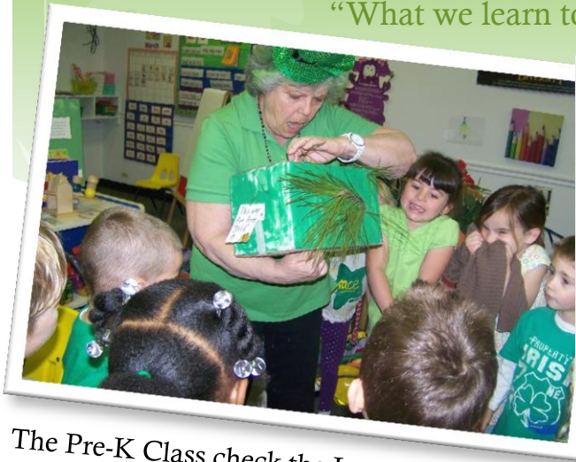
The Pre-K Class check the Leprechaun Trap!

“What we learn to do we learn by doing” Piaget